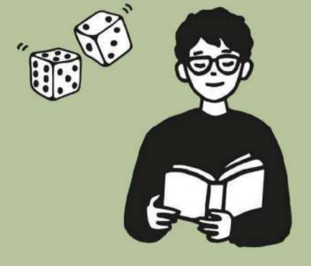
READ OR LISTEN TO AN UPLIFTING PODCAST