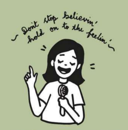
KARAOKE AT HOME